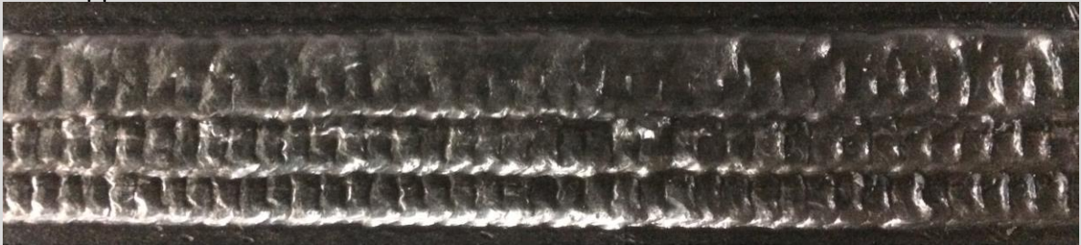
DW-A62LSR, 0.045", vertical upward welding at 51kJ/inch with 80%Ar-20%CO 2 gas