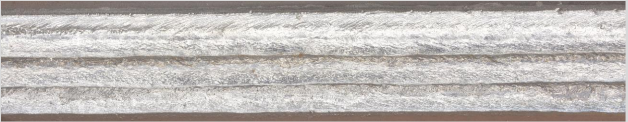
MX-50R, 0.052", Horizontal Fillet Welding with ARCMAN™ robotic system with 100%CO 2 gas